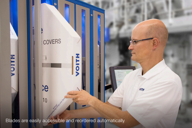
Blades are easily accessible and reordered automatically

Maintaining an available supply of coater and doctor blades is essential to operational efficiency in the mill. However, keeping inventory on hand equates to added overhead. Fortunately, Voith's automated inventory management system represents a new level of efficiency—and an opportunity to boost your profitability.