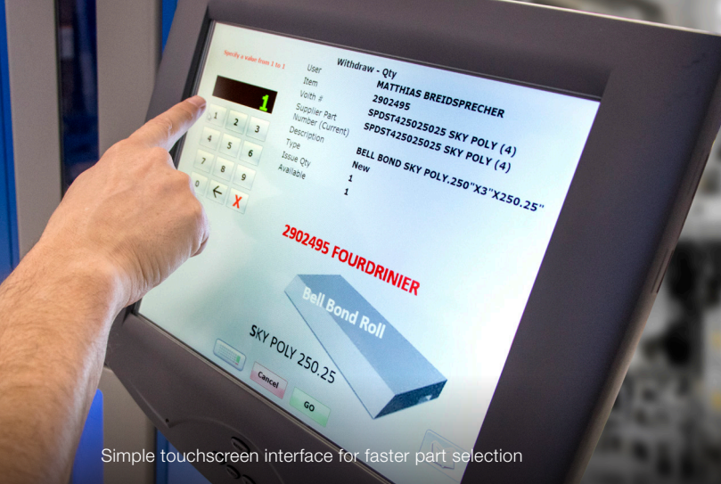
Simple touchscreen interface for faster part selection