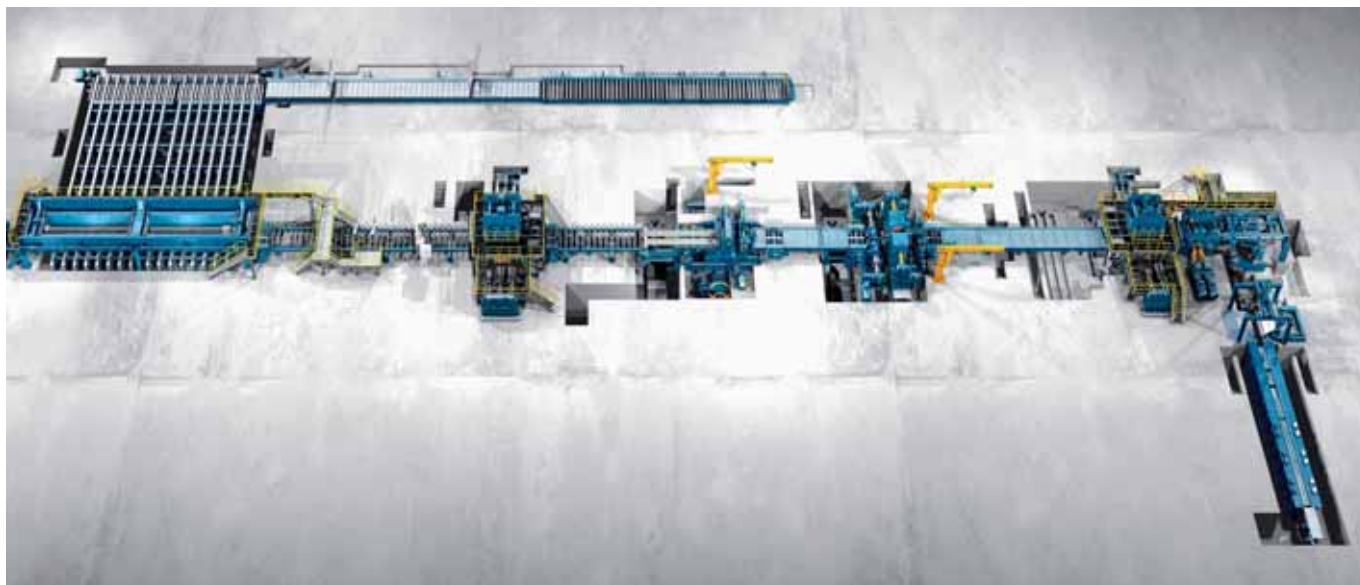
Typical cutting line including levelling equipment